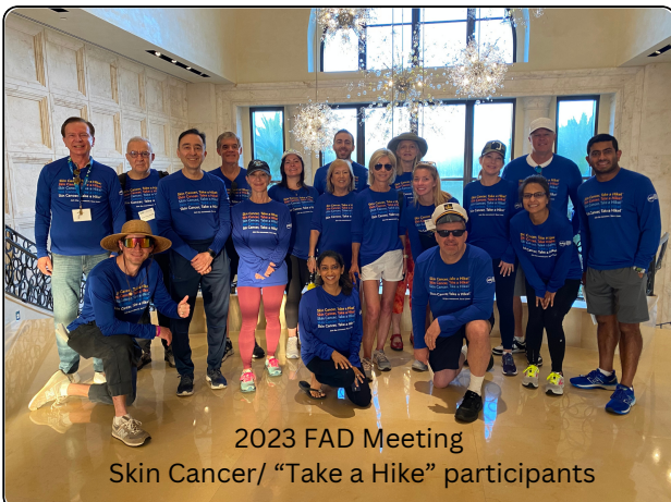
2023 FAD Meeting Skin Cancer/ "Take a Hike" participants

*VIP Lounge Sponsorship option to add additional sponsorship valued at $5000